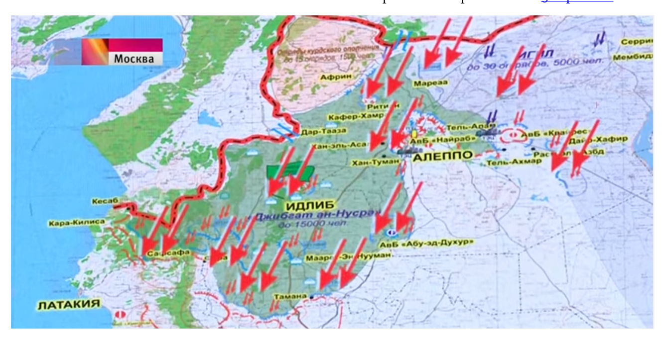
Referring to the map, deputy chief of staff of the Russian military Andrey Kartapolov said, "As I hope you can see, we are striking only the facilities of internationally recognized terrorist organizations such as ISIS and Jabhat al-Nusra."

Russia's claims are untrue. Although Jabhat al-Nusra does control territory in Idlib Province, Russian air and cruise missile strikes have consistently targeted terrain in Northwestern Syria controlled by other rebel groups including at least five U.S.-backed rebel factions. The U.S. State Department reported that 90 percent of Russian