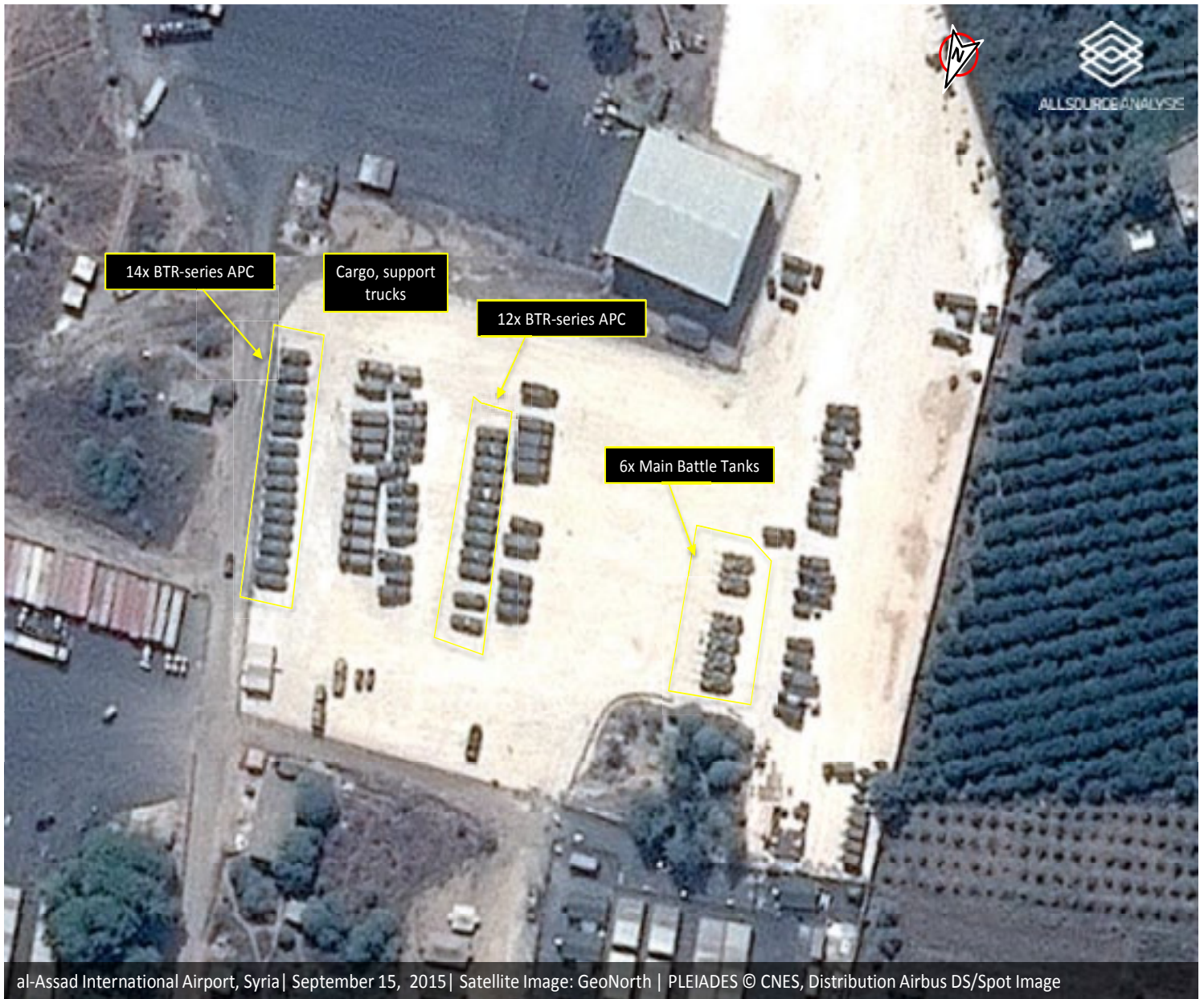
al-Assad International Airport, Syria | September 15, 2015 | Satellite Image: GeoNorth | PLEIADES © CNES, Distribution Airbus DS/Spot Image

Satellite imagery of Al-Assad Airport on September 15, 2015 confirms the new arrival of Russian tanks and armed personnel carriers to Al-Assad Airport.