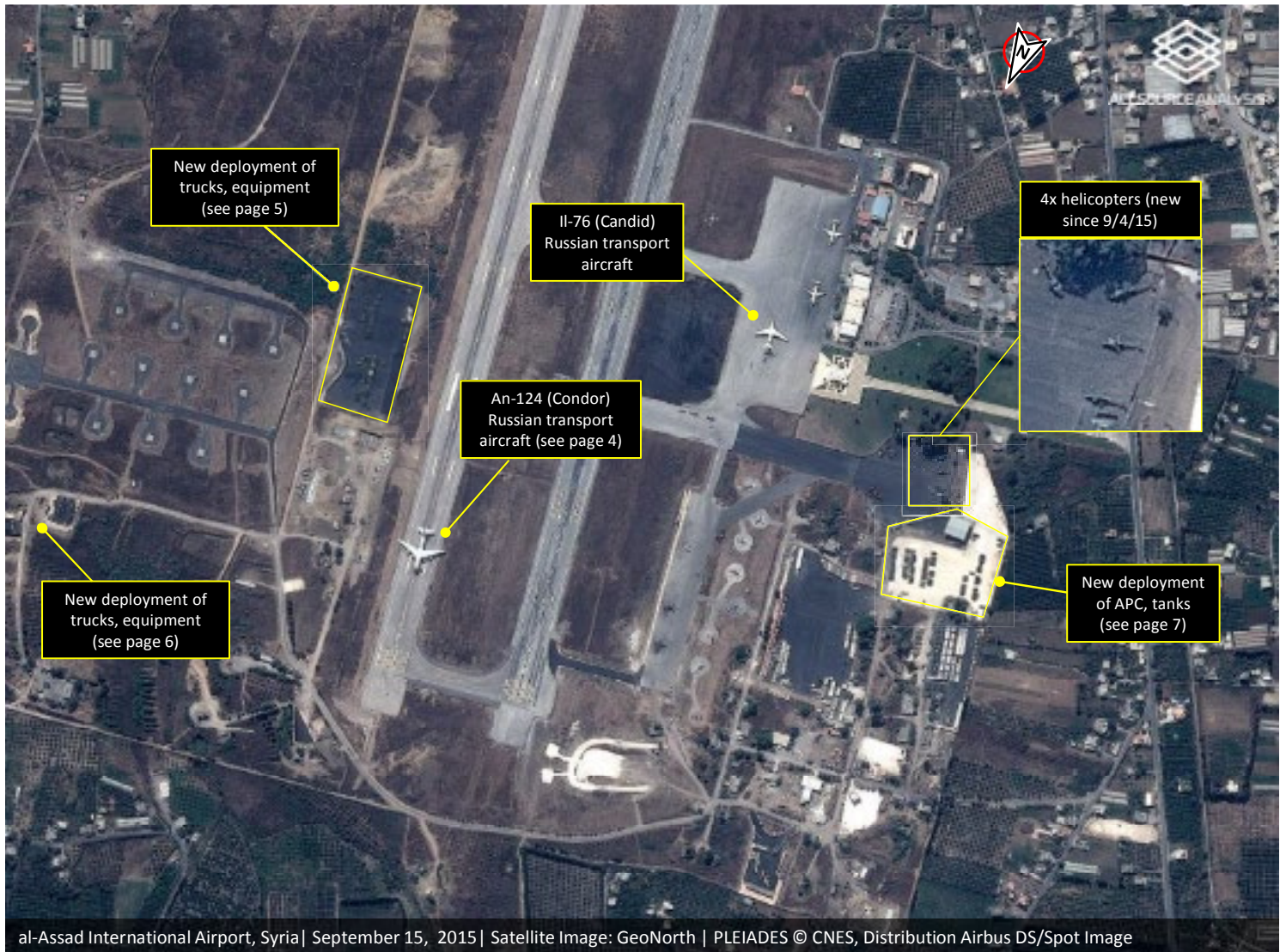
al-Assad International Airport, Syria | September 15, 2015 | Satellite Image: GeoNorth | PLEIADES © CNES, Distribution Airbus DS/Spot Image

Multiple Russian transport aircraft, as well as helicopters, tanks, trucks, and armored personnel carriers arrived at Al-Assad Airport between September 4 and 15, 2015.