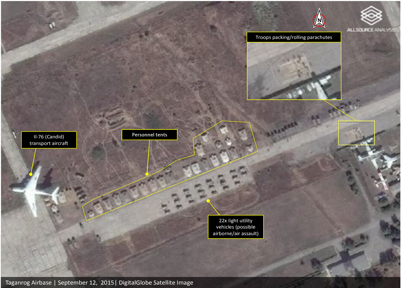
Taganrog Airbase | September 12, 2015 | DigitalGlobe Satellite Image

Satellite imagery of the Taganrog Central air base in southwestern Russia shows forces staging for deployment, possibly to Syria.