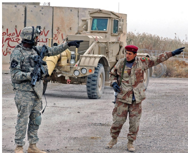
A Soldier talks with an Iraqi Army soldier during a route clearance mission in support of Operation Raider Harvest in the northern Diyala River Valley, Diyala province, Iraq, Jan. 10.

In December 2007 Coalition Forces conducted a reconnaissance in force of the Breadbasket in order to collect intelligence, determine how AQI functioned in the area, and set forces for Operation Iron Raider. xvii Iron Raider targeted about 50-60 senior AQI leaders and about 200 lower-level fighters. xviii The purpose of Iron Raider was to clear AQI out of the Breadbasket and deny enemy safe havens in the area. It also aimed to disrupt AQI funding sources, the Vehicle Borne Improvised Explosive Device (VBIED) network in Diyala, and most importantly establish lasting security in the area. xix Raider Harvest differed from previous operations in the Breadbasket because more troops flooded into the area during the operations, intending to hold the territory once it was cleared. General Petraeus explained “We’d actually been in and out of there a number of times in recent months, conducting very substantial raids and other operations. But this is one...to really clear it from one end to the other, and then to hold it.” xx