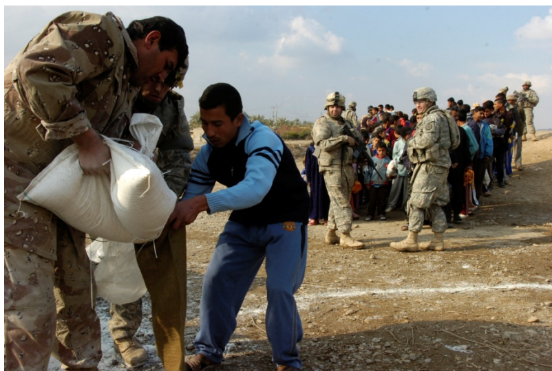
A Warrant Officer from the 5th Iraqi Army Division pours flour into an Iraqi man's burlap sack during a humanitarian aid mission in Mansuriyah, Jan. 13, conducted by the Iraqi Army and Soldiers of Troop G, 2nd Squadron, 3rd Armored Cavalry Regiment 4th Stryker Brigade Combat Team, 2nd Infantry Division.