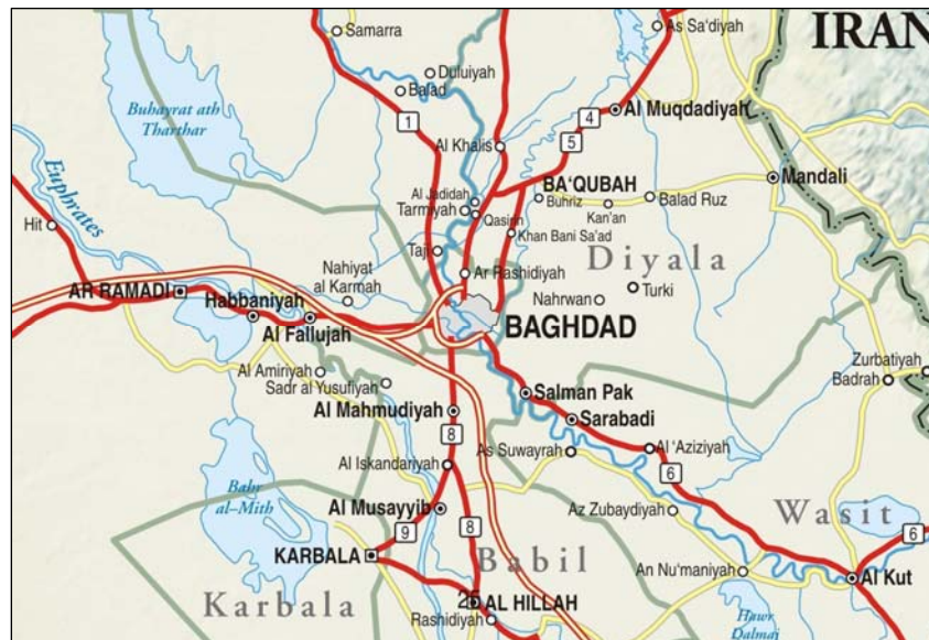
Map 4: Central Iraq (Philip Schwartzberg, Meridian Mapping)

north-south lines of communication meet. The east-west axis connects Diyala province to the Lake Tharthar and the Tigris River Valley networks. From the Tigris River Valley this line runs through the Khalis corridor, Baqubah, Buhriz, and out to Kan'an and Balad Ruz. In this area the east-west axis meets up with north-south lines of communication that run along the 2/3 Highway connecting Kirkuk to Baghdad and the 4/5 Highway that runs from upper Diyala down along the river valley through Muqdadiah and Baqubah to Khan Bani Saad and eventually Baghdad. An important road leads from Kan'an through Nahrwan and connects to eastern Baghdad. The Diyala suicide bombing network regrouped in the Baqubah-Khan Bani Saad corridor where they are able to link to lines of communication from Mosul and project force north into Baqubah as well as south into Baghdad. Beginning in December, Coalition Forces began to develop intelligence about this network. In January and February, Coalition and Iraqi Security Forces moved to dismantle it.