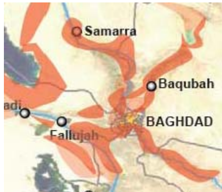
Map 2: Areas of AQI Control in the Baghdad Belts in December, 2006.

AQI not only used the belts to project force into Baghdad, but also south of the capital into northern areas in Babil and Wasit provinces. This system allowed AQI to maintain a steady tempo of spectacular VBIED attacks throughout central Iraq.